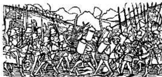
Battle scene; from Johannes de Thwroc, Chronica Hungarorum, Augsburg (Ratdolt) 1488.

This announcement is an official informational release by the Society for Creative Anachronism, Inc. Permission is granted to reproduce this announcement in its entirety in newsletters, websites and electronic mailing lists.