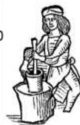
Art & Sciences

Site Fee (Camping or Day Trip) $10 Minor Site Fee (7-17) $7 Feast (Adult and Minor) $10 Children 6 and under FREE