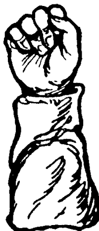
Power to the Peons!

Contact Francesca at 471 2727 for details.