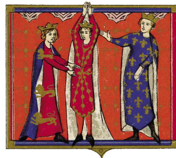
You hold his hands . . . I'll tickle him!

Spring Crown Tourney be held on May 6 th in a location TBA.