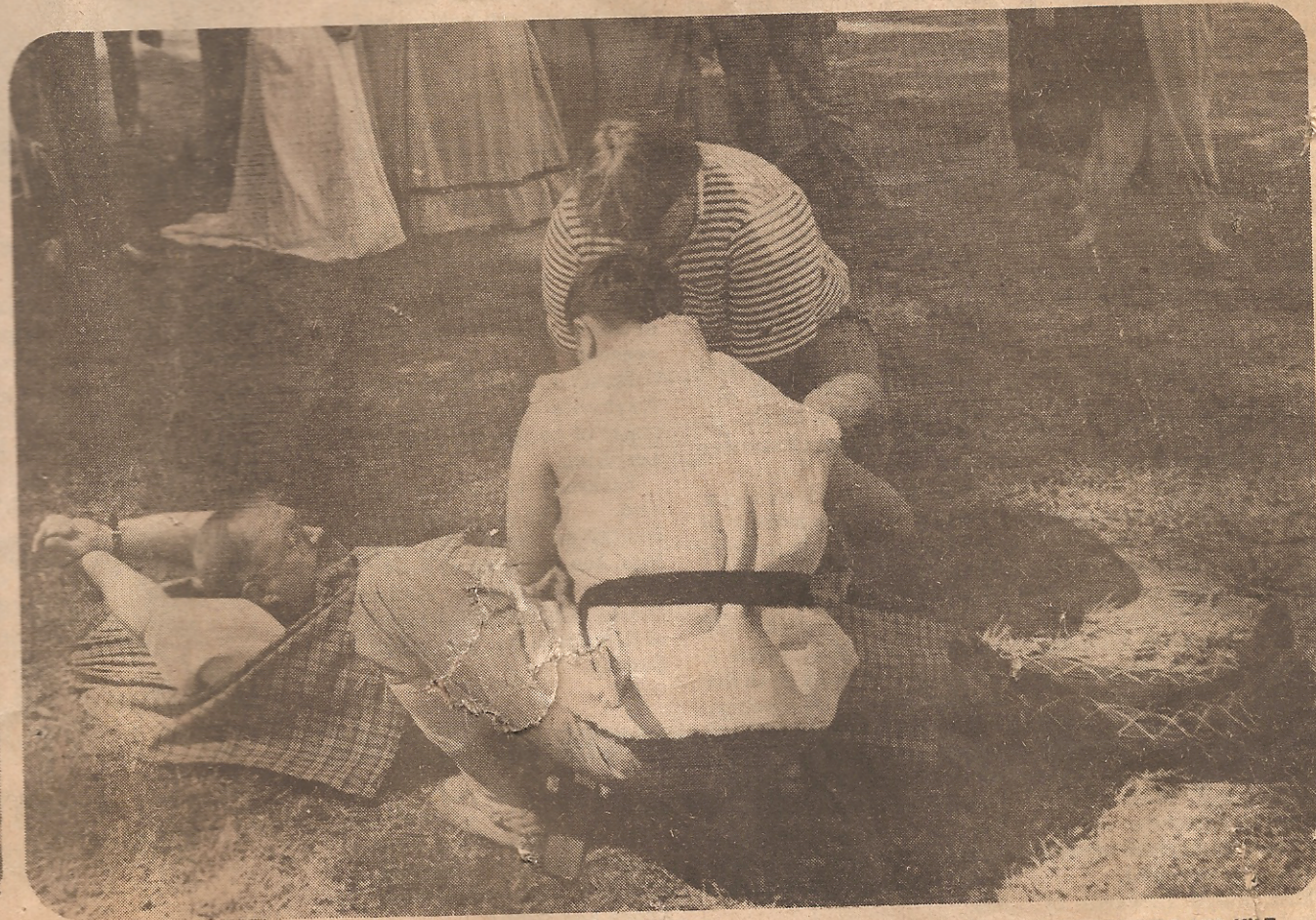
THESE ARE NOT MEMBERS OF A MEDIEVAL RESCUE SQUAD — JUST SCA'ERS HELPING A SCOTSMAN INTO HIS KILT