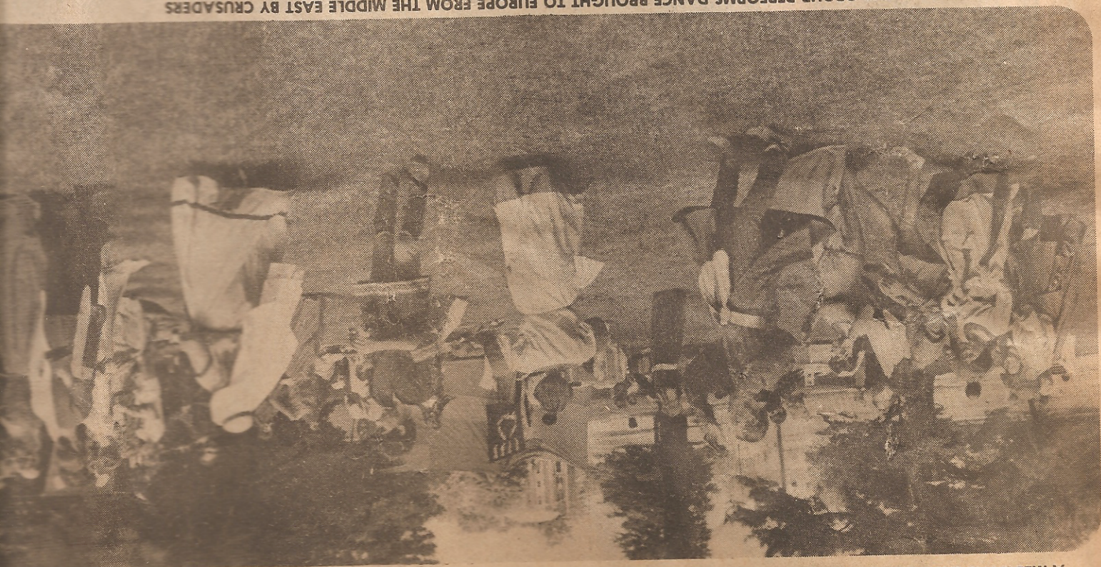
THE GROUP PERFORMS DANCE BROUGHT TO EUROPE FROM THE MIDDLE EAST BY CRUSADERS