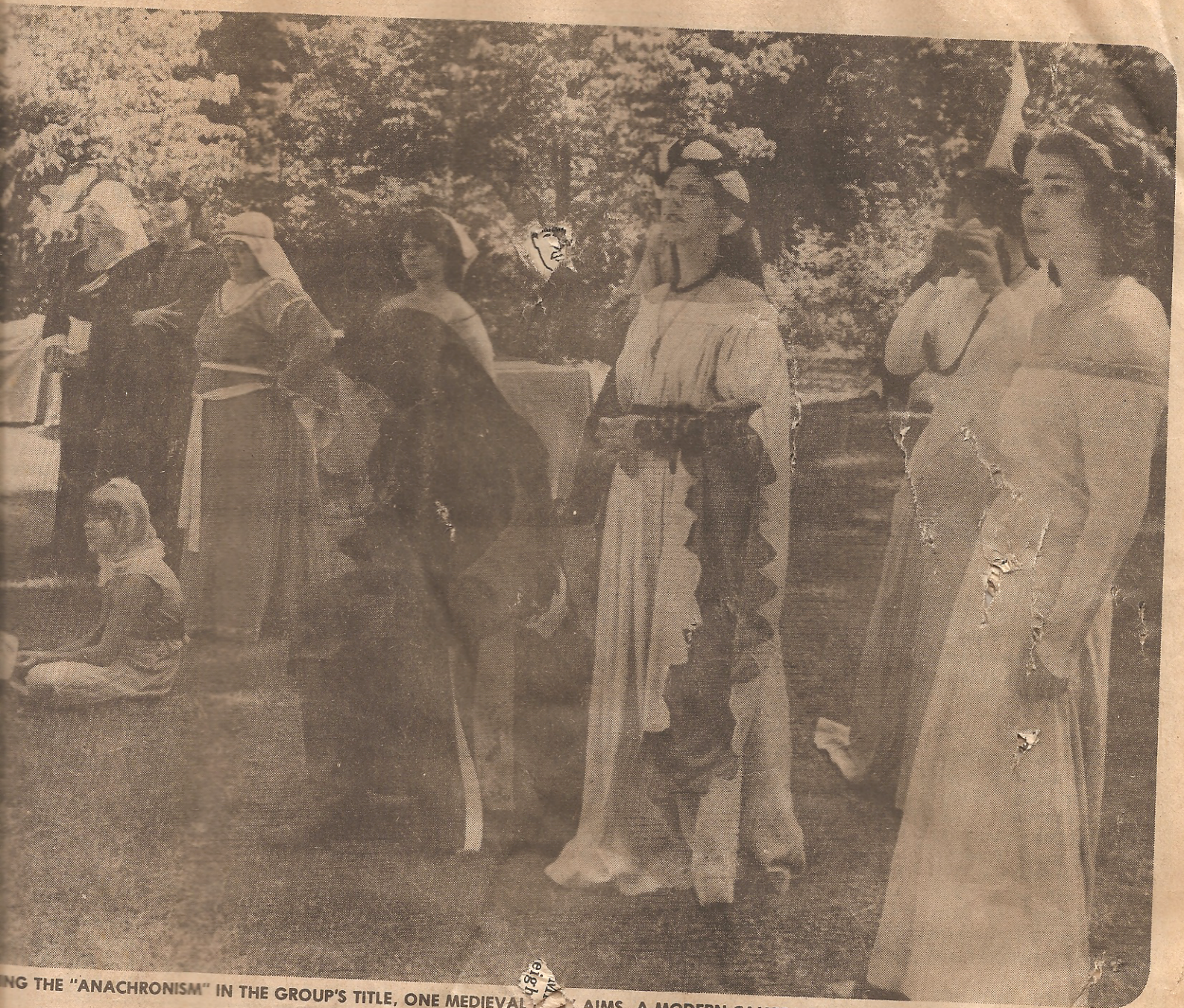
ING THE "ANACHRONISM" IN THE GROUP'S TITLE, ONE MEDIEVAL AIMS A MODERN CAMERA DURING THE COSTUME PARADE