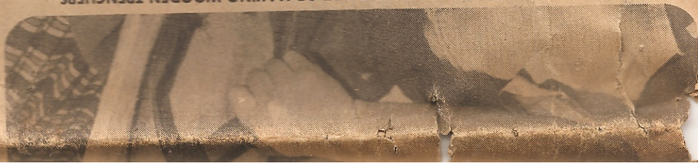
A MEDIEVAL LADY DEMONSTRATES THE ART OF MAKING WOODEN TRENCHERS

repairs of armor, shields, bows and arrows, spears, and other medieval crafts of the gentler crafts of medieval life were also displayed by group members. Demonstrations of group dances, crafts from SCAers) folded and not-so-silent away.