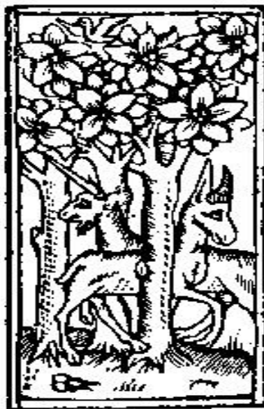
15 th century way to say 'I Love you two dear' That's right. I said it. Tax me. I dare you.

- Yours in Service, Anonymous Scantily Clad Officer of some bizarre office.