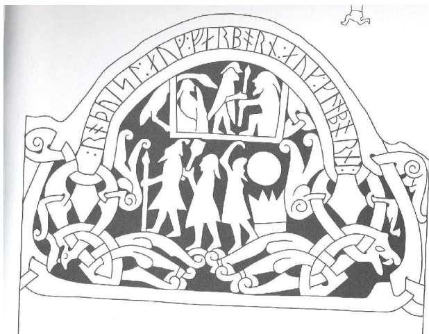
Picture from the Gotland Stone, Sweden, tenth century.

Greetings and welcome to the April 2005 issue of the Windlore, the newsletter for the Barony of Windmasters' Hill. This newsletter is distributed primarily in an electronic format and is accessible from the website www.windmastershill.org . If you desire to be sent a hard copy of the windlore via mail, please submit a written request to the Barony by coming to a monthly Baronial Meeting or by contacting the Baronial Chronicler: